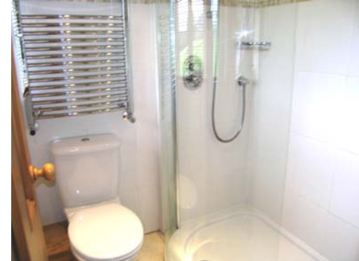
En suite shower room